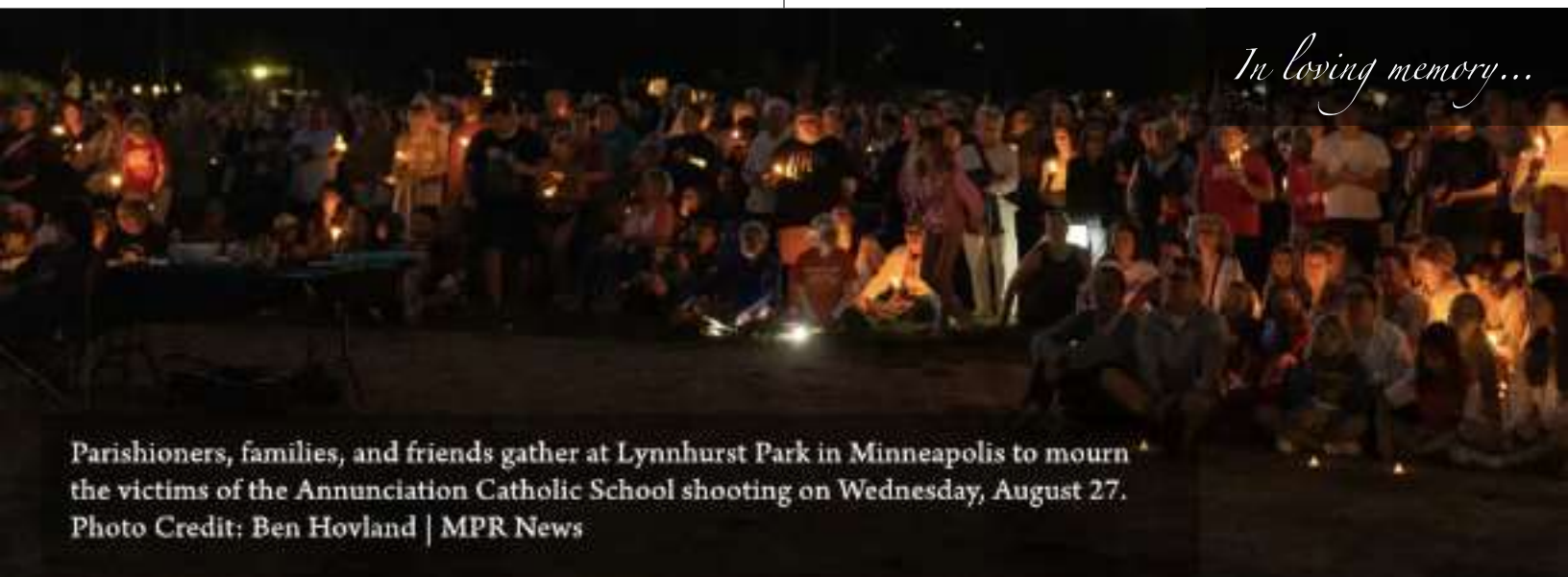
Parishioners, families, and friends gather at Lynnhurst Park in Minneapolis to mourn the victims of the Annunciation Catholic School shooting on Wednesday, August 27.